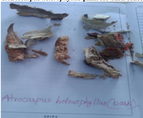
Fig 1. Artocarpus heterophyllus plant for bark collection