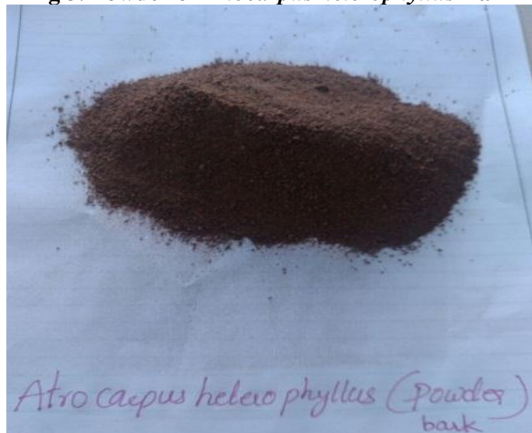
Fig 3. Powder of Artocarpus heterophyllus Bark