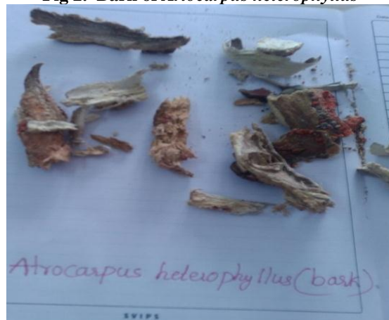
Fig 2. Bark of Artocarpus heterophyllus