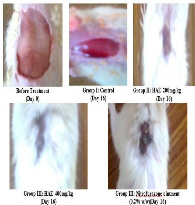
Fig 1. Wound healing activity of HAE on Excision wound model